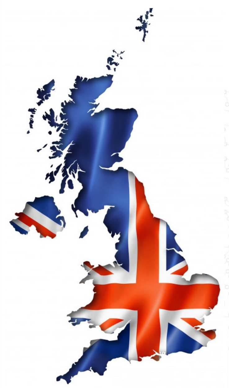
a priority target for attack.