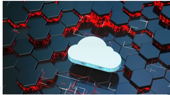
Figure 28: UK and allies expose evolving tactics of Russian cyber actors.

Malicious cyber actors linked to Russia's Foreign Intelligence Service (SVR) are adapting their techniques in response to the increasing shift to cloud-based infrastructure, UK and international security officials have revealed.