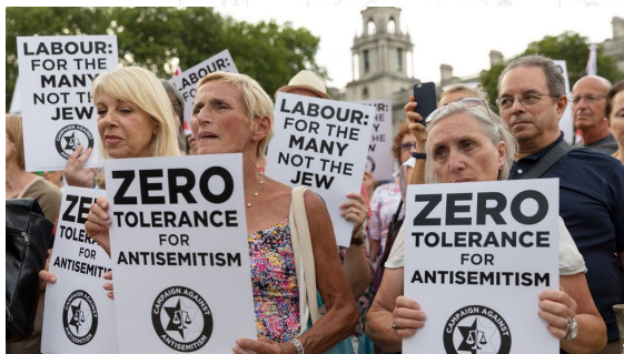
Figure 7: Anti-Semitic abuse at record high.

The scale of the surge in antisemitism in the UK since Hamas's attack on Israel on 7 October has been revealed, in data showing a 589% increase in the number of incidents compared with the same period in 2022.