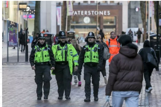
Figure 14: General image of police in the city centre.

They arrested three youths -who were all under the age of 18- and they remain in custody. Police also recovered knuckledusters and combat knives during the chase.