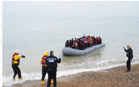
Figure 21: UK reaches agreement with EU's border agency to halt small boat crossings in the Channel.