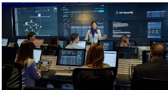
Figure 25: Vulnerable UK energy system among top targets for cybercriminals as businesses face growing extortion threat.

IBM HAS released the 2024 X-Force Threat Intelligence Index highlighting an “emerging global crisis” as cyber criminals double down on exploiting user identities in a bid to compromise today’s enterprises. According to IBM X-Force, which is IBM Consulting’s security services arm, cyber criminals generated more opportunities to ‘login’ to corporate networks last year through valid accounts instead of hacking into them, rendering this tactic a preferred ‘weapon of choice’ for threat actors.