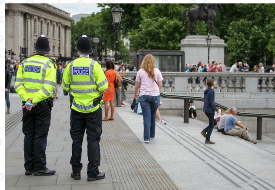
Figure 23: Met launches Stop and Search charter survey.

The online survey focuses on the public's perception of stop and search, personal experiences of the tactic, training for officers, and what could be done better.