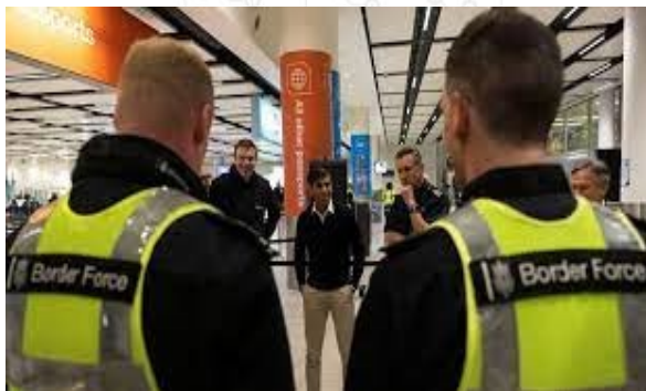
Figure 11: Home Office rejects claims security checks missed on 'high-risk' flights.

The Home Office “categorically rejects” claims that hundreds of high-risk flights landed in the UK without security checks, according to an immigration minister.