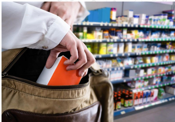
Figure 20: Violence, Abuse against UK Retail Staff Rises to 1,300 Incidents A Day.

Violence and abuse against shop workers rose to 1,300 incidents a day last year, according to a leading trade body.