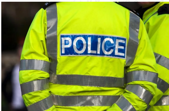
Figure 5: Counter Terrorism Policing Northeast.

A 24-year-old man from Newcastle has been charged with eleven offences following an investigation by Counter Terrorism Policing North East.