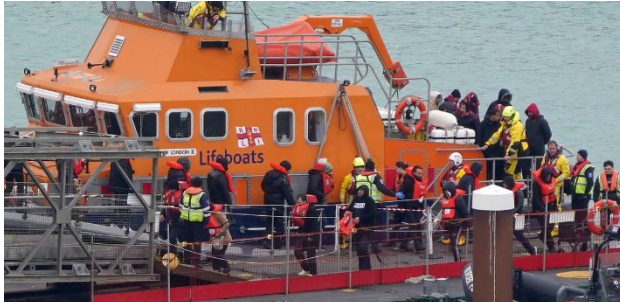
Figure 15: Hundreds of small boat migrants charged with illegal entry to UK after new powers come into force.

Hundreds of small boat migrants have been charged with arriving illegally in the UK, or arranging the arrival of others, in the year after new powers came into force.