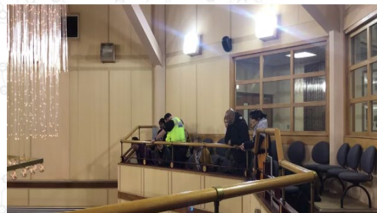
Figure 30: Protestors halt council meeting.

A council meeting was brought to a halt by pro-Palestinian protestors for the second time in three weeks. Sandwell councillors briefly abandoned Tuesday's key budget meeting after it was interrupted by protestors demanding the authority discusses supporting an immediate ceasefire in Gaza.