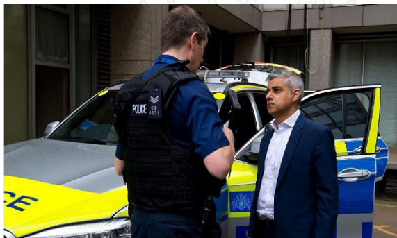
Figure 24: Sadiq Khan said keeping Londoners safe was his “number-one priority”.

The Mayor of London has announced an additional £151 million for policing and crime prevention as part of his final draft budget for 2024-25.