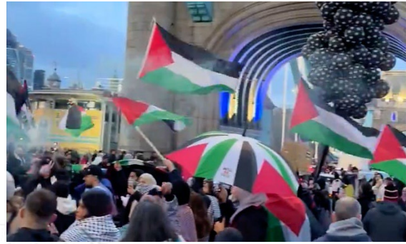
Figure 32: London's Tower Bridge closed due to pro-Palestine demonstration.

Some activists were seen lighting flares and waving Palestinian flags and calling for a ceasefire to the ongoing violence in Gaza, according to footage on social media. The landmark was closed by City of London police before being reopened approximately an hour later.