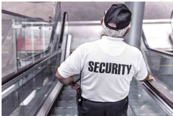
Figure 22: 6 in 10 adults say they have trust in private security professional.

New research from the Security Industry Authority (SIA) has revealed that 6 in 10 people agree that they trust security professionals.