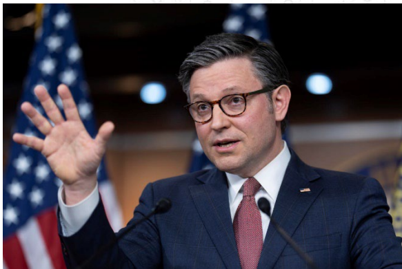
Figure 13: Taxpayer-funded bodyguards and cars 'provided to more MPs due to safety fears'.

Taxpayer-funded bodyguards and cars have reportedly been provided to more MPs amid growing fears for their safety.