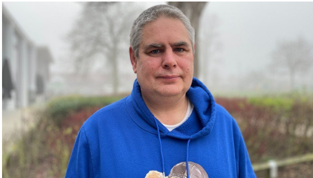
Figure 17: More than £5k raised for Chesham Bois shop worker after axe attack.

A fundraiser to help a shop worker who was attacked with an axe by two robbers has raised over £5,000. The victim was taken to hospital with serious injuries after the incident at Chesham Bois Store, Buckinghamshire. Thames Valley Police have appealed for witnesses and information.