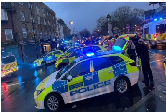
Figure 19: Clapham shooting: Three injured after shots fired by moped driver in police pursuit.

Three people have been injured in Clapham, south London, in a shooting that happened during a police pursuit. Two people suffered shotgun pellet injuries when a weapon was fired by a moped rider being pursued by officers near Clapham Common South Side, the Metropolitan Police said.