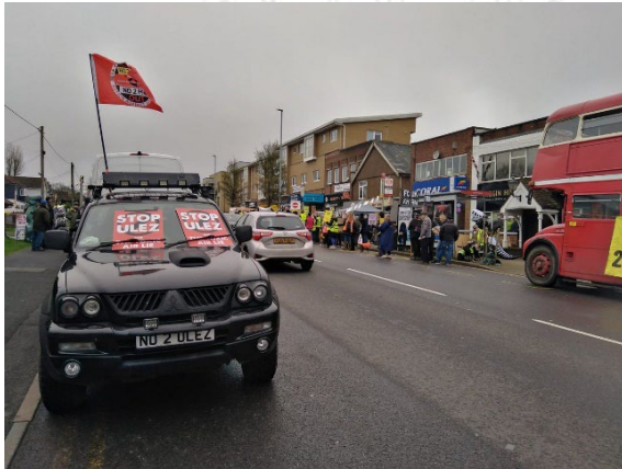
Figure 29: Hundreds of protesters descend on Biggin Hill for 'Funeral for Ulez' march.

A “funeral for Ulez” has been held in south-east London to protest against Sadiq Khan’s clean air zone. Around 500 protesters, some dressed as skeletons and t-rexes declared “Ulez is dead” as they marched through Biggin Hill. Flowers were thrown in front of a hearse while buskers and DJs performed at the Day of the Dead-themed event.