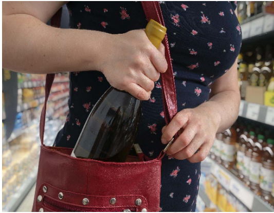
Figure 26: The number of shoplifting offences has risen above 400,000 for the first time since current records began.

The British Retail Consortium's Retail Crime Survey 2022-2023 highlights that the cost of retail theft doubled to £1.8 billion, with upwards of 45,000 incidents occurring each day. Violence and abuse against retail workers has soared by 50%. The number of incidents rose to 1,300 per day during the survey period from almost 870 per day the year before. According to the BRC, this is now "a crisis that demands action".