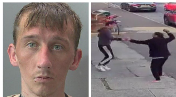
Figure 10: Shop worker attacks robber with shoe after he hit her with fake crutch during theft.

Cambridgeshire Police identified him using the CCTV from outside the shop. He was found with an empty bottle of vodka and a pouch of tobacco believed to have been stolen in the