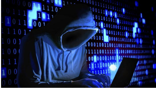
Figure 27: A man performing Hacking.

The UK and its allies have issued a fresh warning to Critical National Infrastructure (CNI) operators concerning the threat posed by cyber attackers using sophisticated techniques to camouflage their activity on victims' networks. The National Cyber Security Centre (NCSC) and agencies in the US, Australia, Canada and New Zealand have detailed how threat actors have been exploiting native tools and processes built into computer systems to gain persistent access and avoid detection.