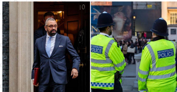
Figure 16: Home Office unveils £31m security package as Cleverly vows to 'protect MPs from intimidation'.

Under the plans, all elected MPs and candidates will have dedicated named police contact they can discuss security matters with, officials said.