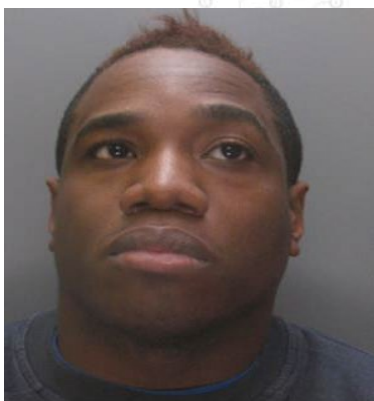
Figure 3: Operation Venetic: Drug smuggler's brother sentenced for role in class A and gun importations.

A former professional footballer who ran a drug and gun importation operation with his brother has been sentenced to 30 years in prison after a National Crime Agency investigation.