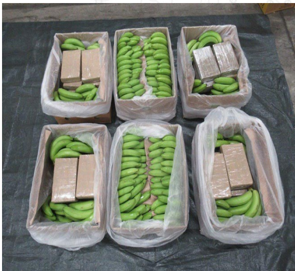
Figure 9: UK's largest ever class A drugs haul found hidden in bananas at port.

The largest-ever haul of class A drugs has been seized at a port in the UK hidden in a bunch of bananas. The drugs, found at Southampton Port, are worth an estimated £450 million.