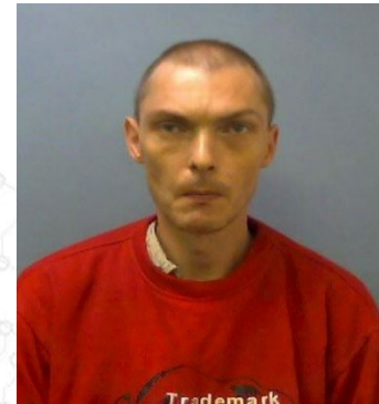
Figure 2: Second scare at UK airport after man without passport or boarding pass evades Gatwick security to board jet to Denmark.

The Brit managed to sneak on to the Norwegian Air flight in a bid to reach Danish capital Copenhagen undetected. But suspicious crew rumbled him before take-off and he was escorted off the Boeing 737 by police. It comes a week after The Sun on Sunday revealed a man flew all the way from the UK to New York without a passport or boarding pass. And the latest security breach is likely to spark fresh Home Office concern over airport checks.