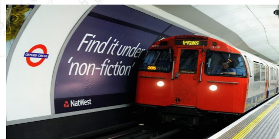
Figure 12: Railway Track.